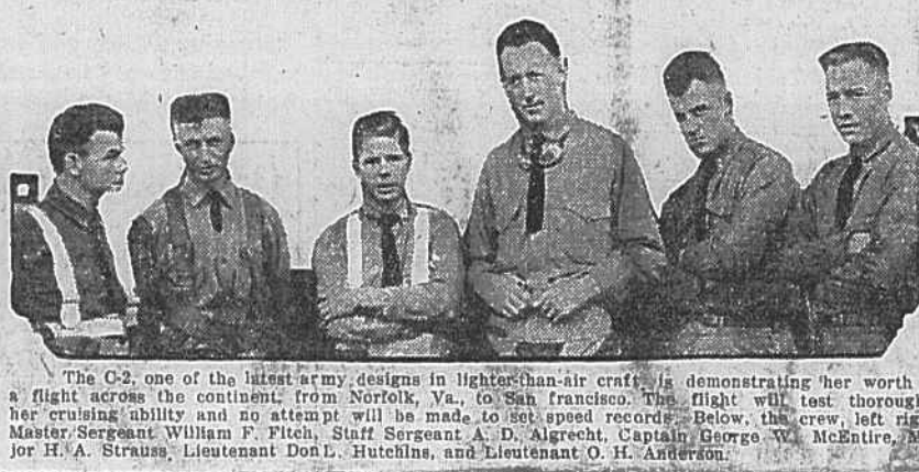
The C-2, one of the latest army designs in lighter-than-air craft, is demonstrating her worth in a flight across the continent from Norfolk, Va., to San Francisco.